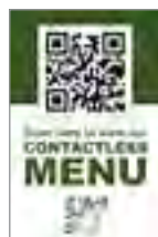
4\"x6\" Table Tent QR Code for Contactless Menu