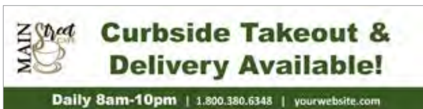
10'x2.5' Outdoor Banner

*Sysco will work with you to design your custom restaurant marketing tools and provide the art files. You can take these files to a printer of your choice depending on your needs.