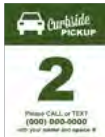
8.5x11 Curbside Pickup Sign