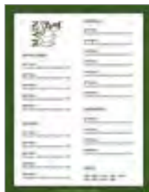
8.5x11 Limited Item Takeout Menu