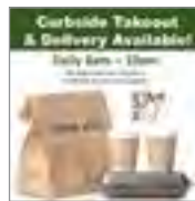
Social Media Post