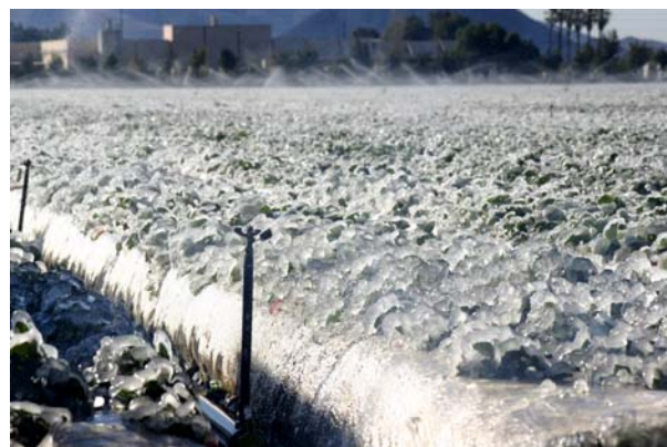
Freezing temperatures can have a hug impact on citrus, row crop vegetables, lettuce, tomatoes and strawberries.

Florida's growers reported only minor damage early Thursday from a blast of cold Artic air, even as snow flurries fell in at least one part of the Sunshine State. Freezing temperatures in Florida this time of year can have devastating impact on citrus, row crop vegetables, lettuce, tomatoes and strawberries.